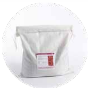
Mixed composting worms*