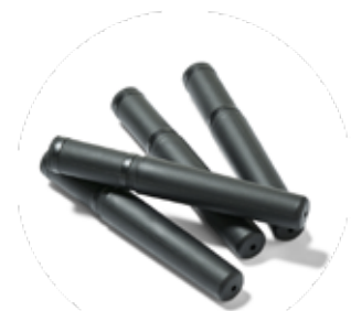
Worm Farm legs*