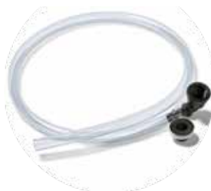
Worm Farm drainage kit*